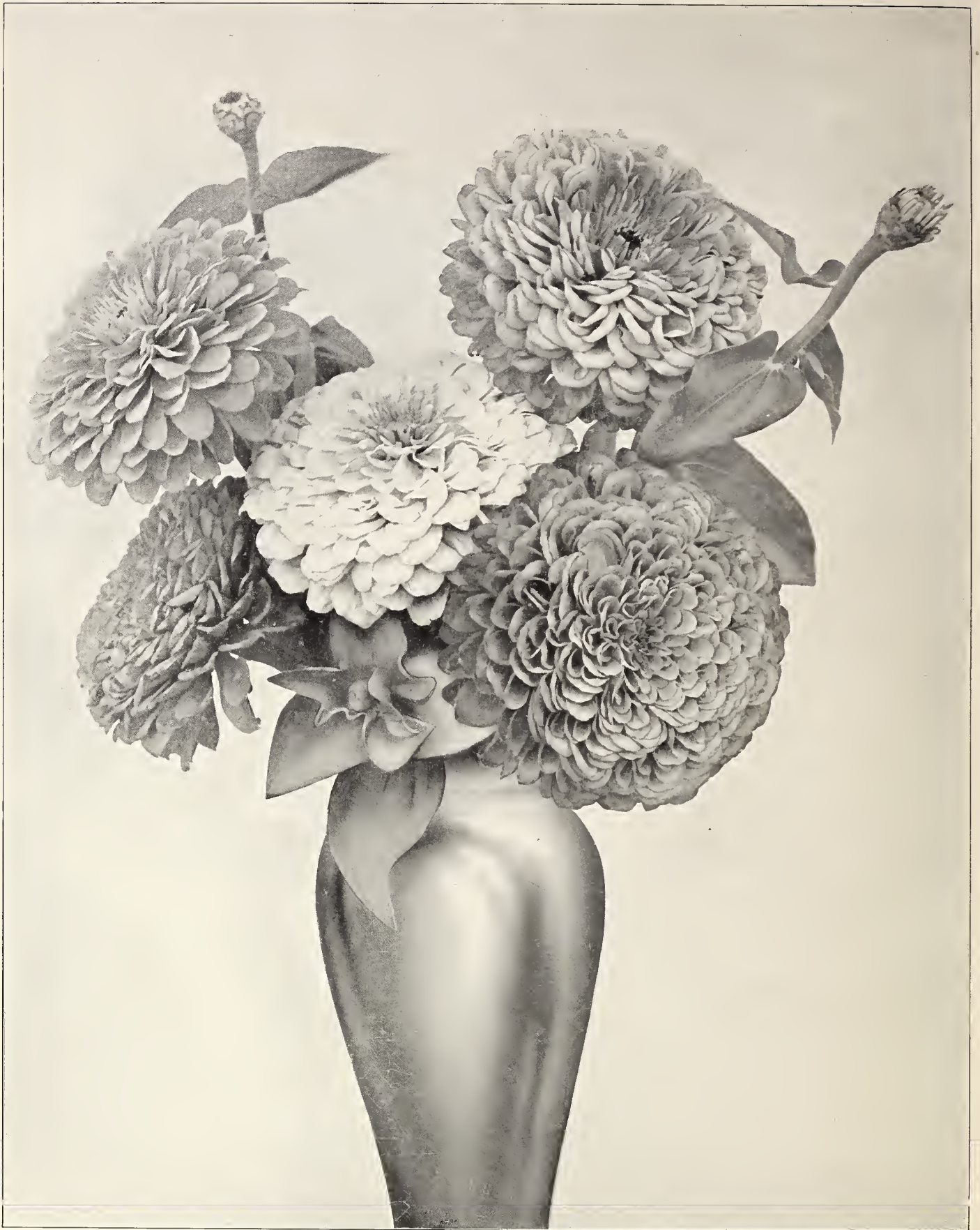
ZINNIA- BODGER'S GOLD MEDAL DAHLIA FLOWERED